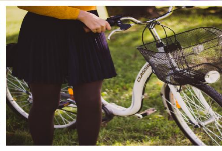
"Gratitude can be expressed through finding joy in leisure, our hobbies and simplicity!"